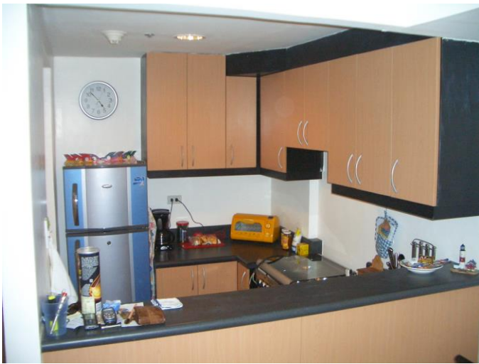
fully equipped kitchen